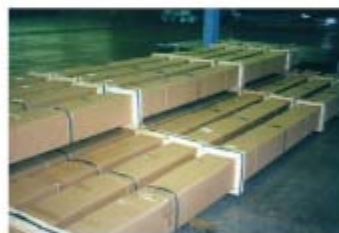
Optional Packaging (Prevent Damage in Transit)

Packed in corrugated box, then steel strapped with four wooden frames.