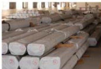
Pipe with PE Film