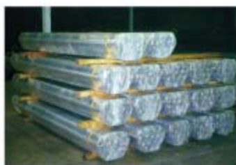
Polished Material's Standard

Plastic sleeved individual tube, then the whole bundle is wrapped with stretch film.