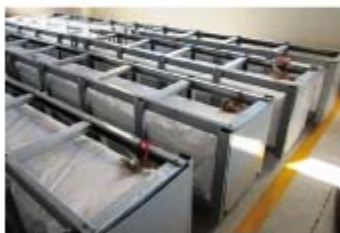
Optional Packaging (Prevent Damage in Transit)

Packed in corrugated box, then steel strapped with four wooden frames.