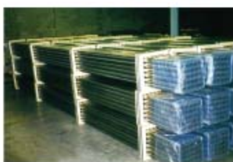
Unpolished Material's Standard

Plastic sleeved individual tube, then the whole bundle is wrapped with stretch film.